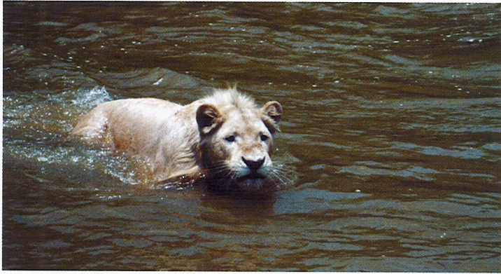
WHITE LION Ster Kinekor (Releases 19 February)