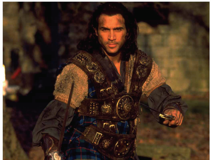
Adrian Paul plays the Highlander for the long-running TV series.

✎ 2000: "Highlander: Endgame" unites Lambert with Donnie Yen, Adrian Paul and the cast of the TV series. Paul is named "Sexiest Action Star" by People Magazine .