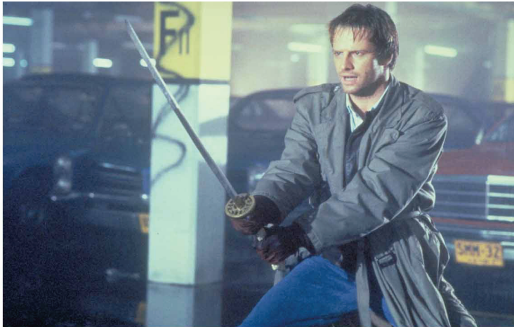
Christopher Lambert wields a katana in the first "Highlander."

✎ 1986: The myth is born. "Highlander" is released starring Christopher Lambert and Sean Connery. Queen writes the title song "Princes of the Universe" and names its album "A Kind of Magic" after a line of dialogue.